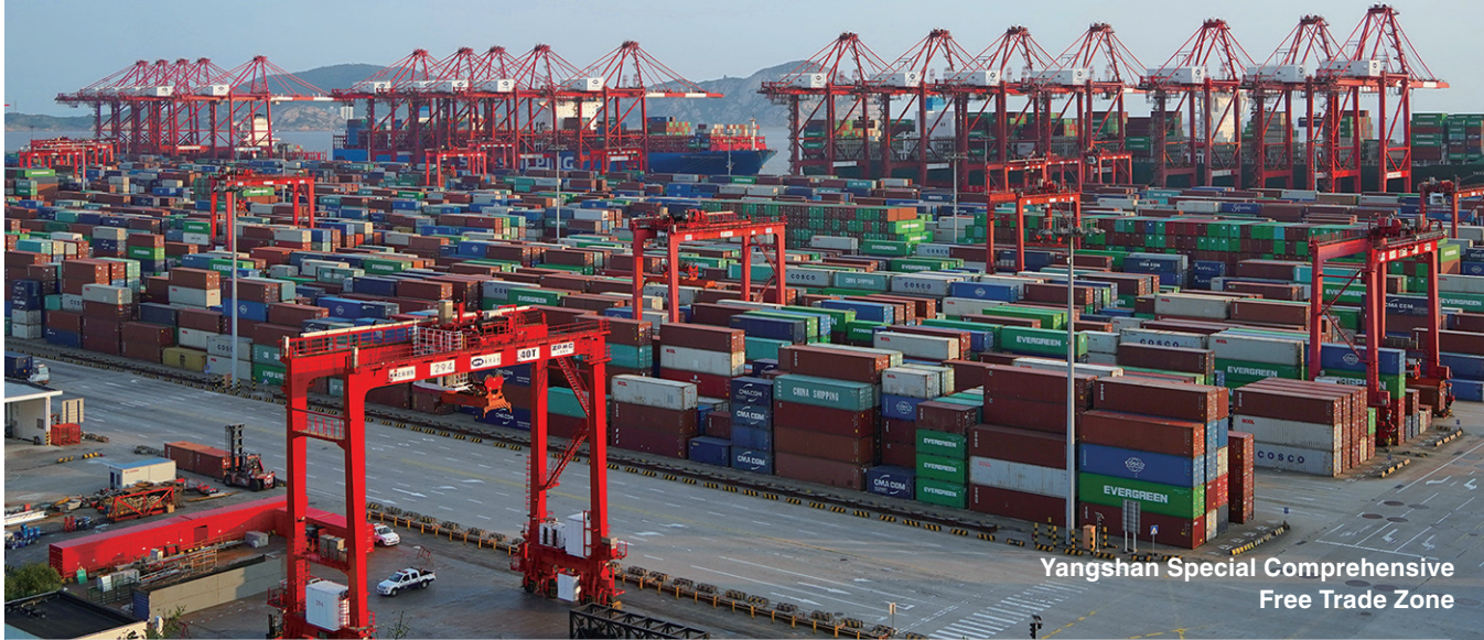
Yangshan Special Comprehensive Free Trade Zone

Over the past three years, the construction of the new Lingang area has achieved remarkable results.